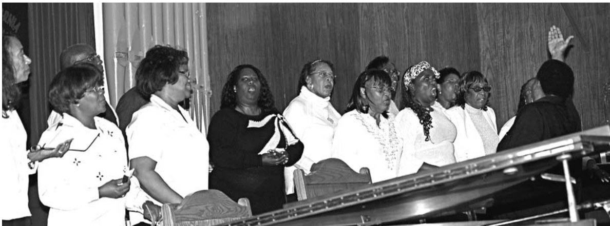
The Choir from the Greater Community Missionary Baptist Church in Pacoima